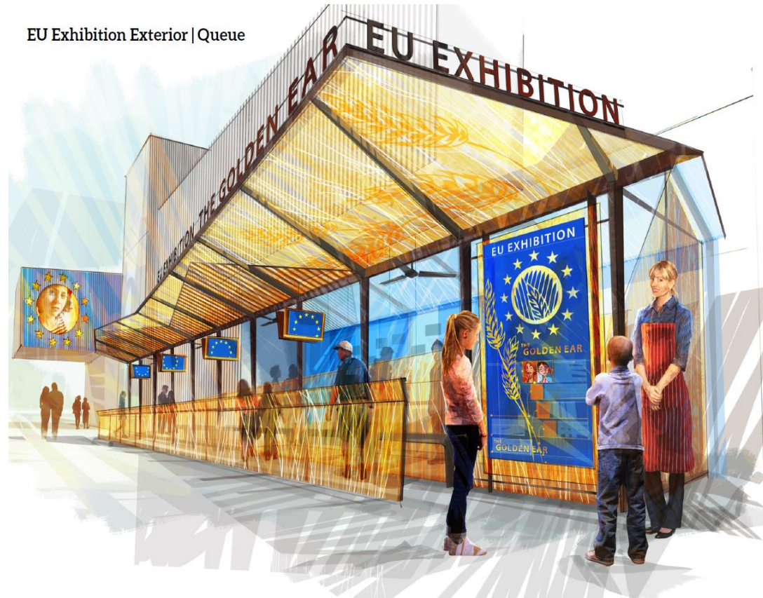
EU Exhibition Exterior | Queue

The aim is to better engage the public , especially young visitors, explaining that global food security can be achieved through good co-operation involving science and food production